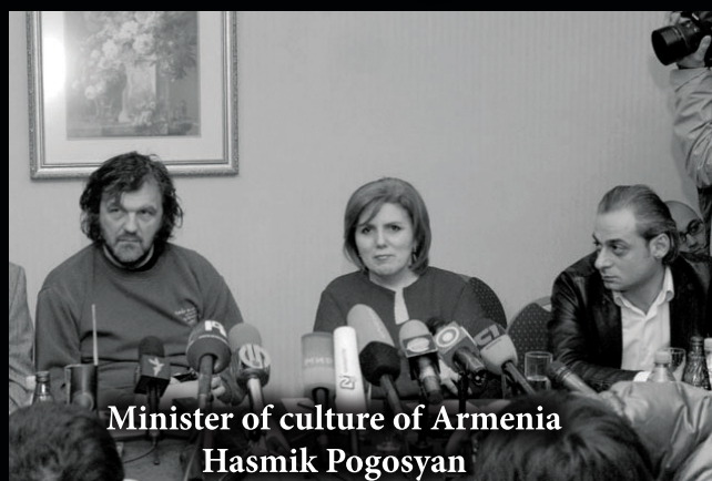
Minister of culture of Armenia Hasmik Pogosyan