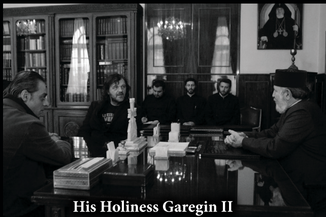
His Holiness Garegin II