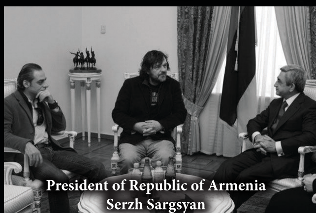
President of Republic of Armenia Serzh Sargsyan